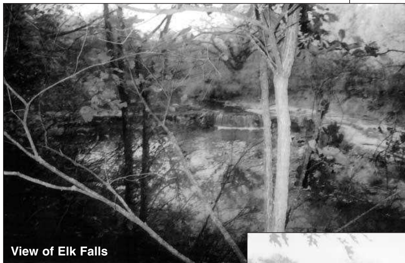
View of Elk Falls